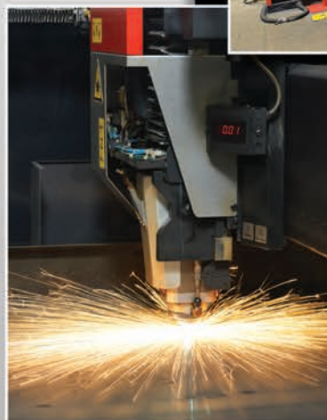
EMLK punch/laser combination with MP automated load/unload system.